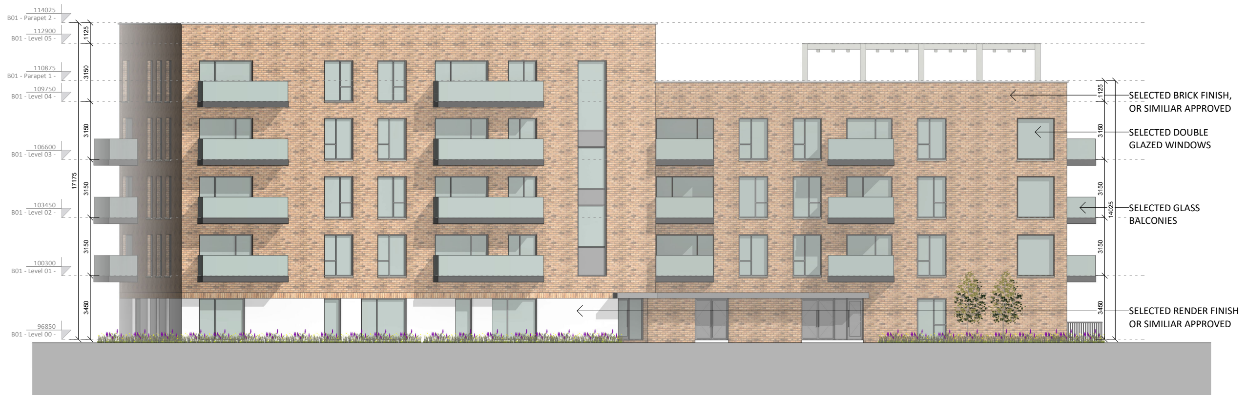
② Block 01 - West Elevation 1 : 200