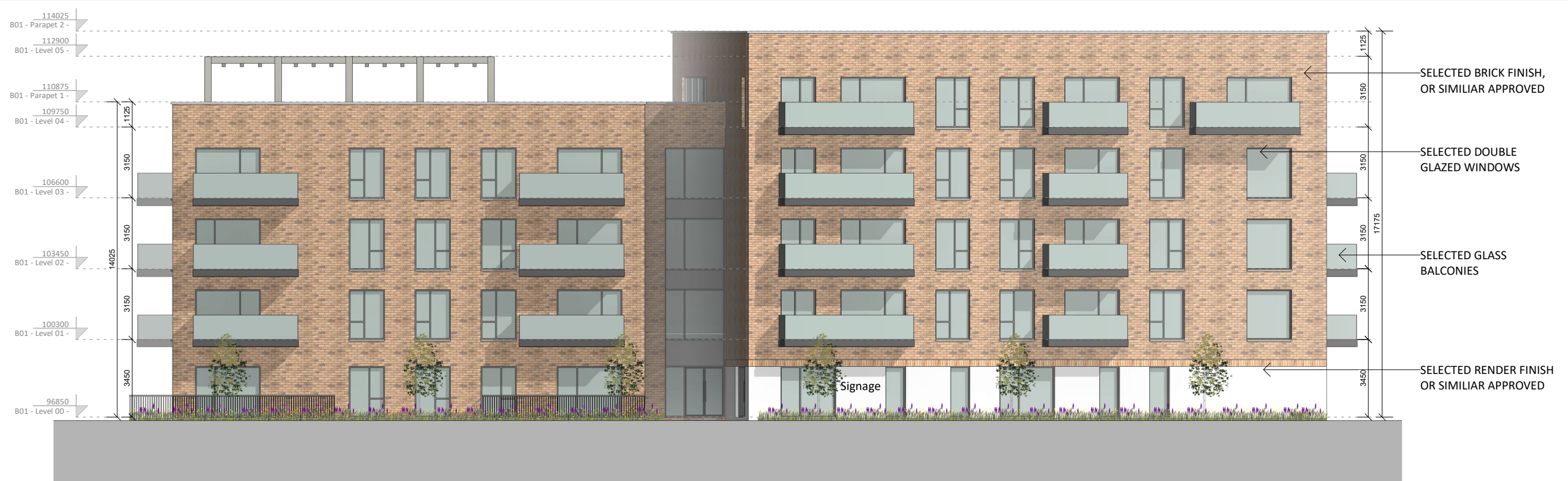
① Block 01 - East Elevation 1 : 200